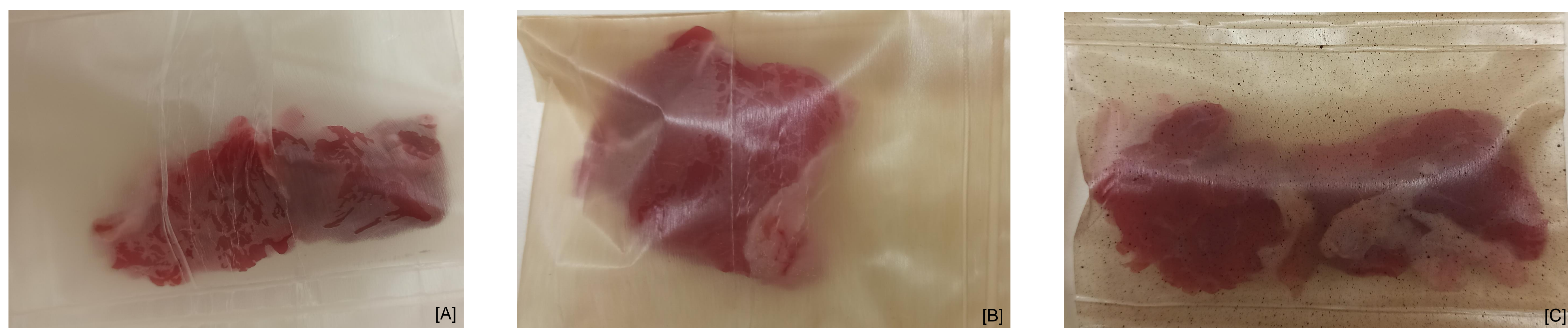
Figure 1. Beef meat packaged with the control (PLA) [A] and active (PLA/3PPE [B]; PLA/3PP [C]) films.