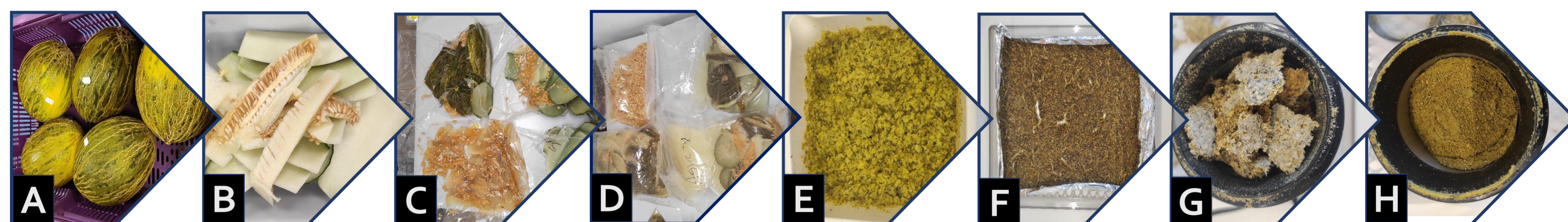
Figure 1. Methodological process for obtaining fermented melon by-products flours.

The nutritional composition was analytically determined (moisture, ash, protein, dietary fibre, fat and salt), while the energy value and carbohydrates were calculated. [5]