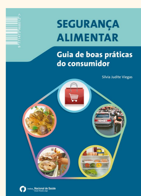
Figure 2: Guide of Consumer Good Practices

B - Food nutrition: The Portuguese Food Composition Database (PFCDDB) 4 (Figure 3), edited and disclosed by INSA, is the reference table of food composition in Portugal. Created in 1961, it is available on printed support, Excel, CD-Rom and online.