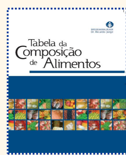
Figure 3: Portuguese Food Composition Table

B - Food nutrition: The Portuguese Food Composition Database (PFCDDB) 4 (Figure 3), edited and disclosed by INSA, is the reference table of food composition in Portugal. Created in 1961, it is available on printed support, Excel, CD-Rom and online.