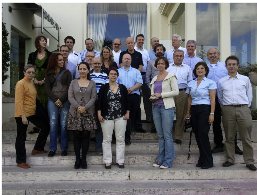
Fig. 2 – Photograph of the EuPA General Council members and participants at the 4th EuPA Scientific Meeting that took place in Estoril, Portugal, 2011.

TIME magazine highlighted biobanking as one of "10 Ideas Changing the World Right Now". Biobanking is rapidly growing and thriving to change approaches to target finding,