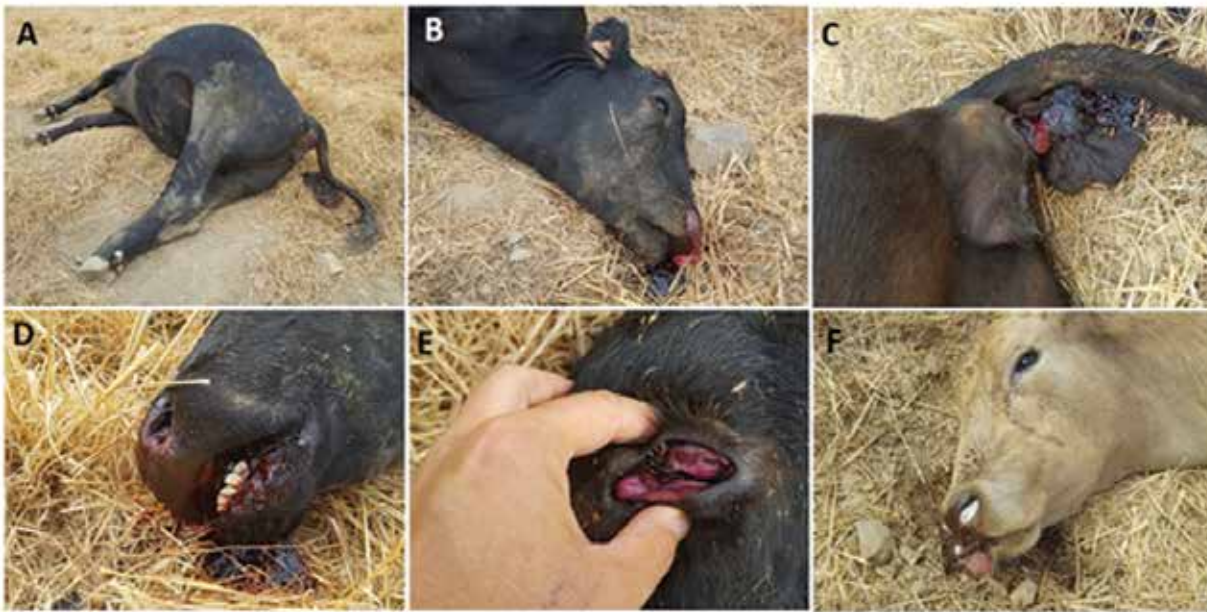
Figure 2. Pathological findings in the intoxicated animals at the outbreak site. A) Abdominal distension, diarrhoea; paddling signs with soil excavation; B) Dorsiflexion of the head and neck (opisthotonus); sunken eye; bloody foam in nostrils; blood in mouth; C) Bloody diarrhea and melena; D) Mouth hemorrhage; E) Third eyelid and conjunctiva mucosa violaceous; F) Foam in nostrils, blood and foam in the mouth and tearing.

Histopathological analysis of the liver revealed a well-preserved parenchyma, with a few foci of scattered hyaline necrosis, some containing numerous long rod bacteria. Necrosis of dispersed hepatic cells and small foci of interlobular infiltration by mononuclear cells (lymphocytes, plasma cells and rare macrophages and neutrophils) was also evident. In the kidney, there was diffuse tubular necrosis, particularly severe in the cortical region, although there were tubes formed by necrotic cells frequently seen in the medullary area of the kidney. Occasionally foci of inflammatory infiltration by mononuclear cells in the interstitial tissue near the renal pelvis was also detected. These lesions were suggestive of dispersed multifocal necrosis triggered by bacterial toxins of intestinal origin, e.g. enterotoxemia. The presence of rod-shaped bacteria in the liver without signs of autolysis suggests intestinal microbial, and the bacteria could have reached the liver through postmortem circulation through the portal vein. Differential diagnosis also included Clostridium perfringens type D infection, organophosphate and carbamate pesticide poisoning, nitrate/nitrite poisoning, water deprivation-sodium ion toxicosis, and neurotoxic plants. 18