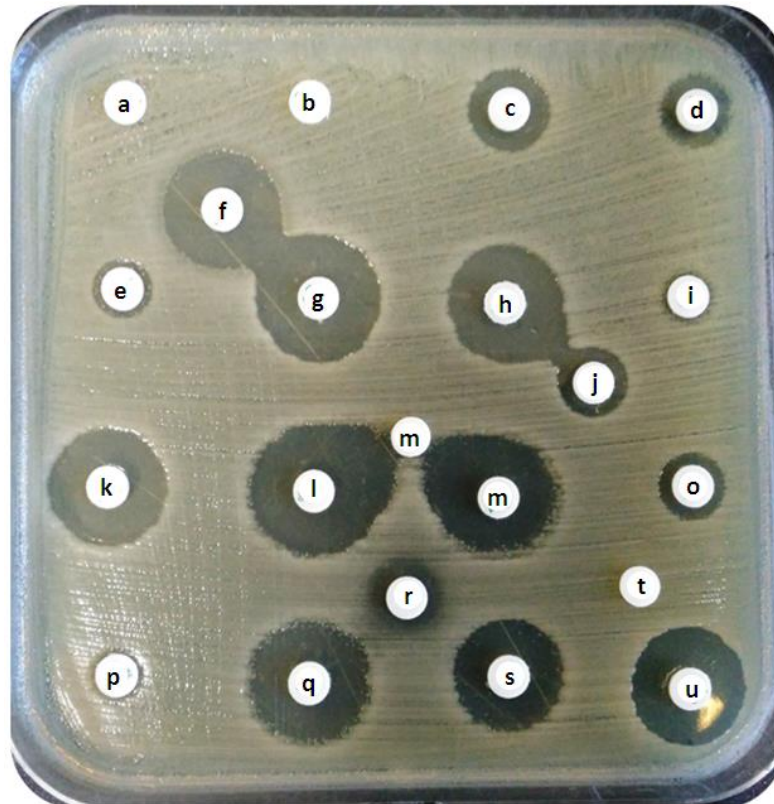
Figure 1. Antibiotic susceptibility testing of a KPC-producing K. pneumoniae . a, amoxicillin; b, ampicillin; c, ceftazidime with clavulanic acid; d, aztreonam; e, amoxicillin with clavulanic acid; f, temocillin; g, cefotaxime with clavulanic acid; h, cefotaxime; i, cefpodoxime; j, cefepime; k, doripenem; l, boronic acid; m, imipenem; n, amoxicillin with clavulanic acid plus cloxacillin; o, ceftazidime; p, piperacillin with tazobactam; q, meropenem; r, imipenem plus dipicolinic acid; s, ertapenem; t, cloxacillin; u, ceftoxitin. Disks with indicator antibiotics and/or inhibitors are used to detect: f, class D carbapenemases; c, e, g, ESBL; n, ESBL in the presence of an AmpC \beta -lactamase; l, class A carbapenemases; r, class B carbapenemases; t, AmpC \beta -lactamases.

an unknown burden in the Middle East, where people often travel to and from India (Dash et al. 2014; Livermore et al. 2011).