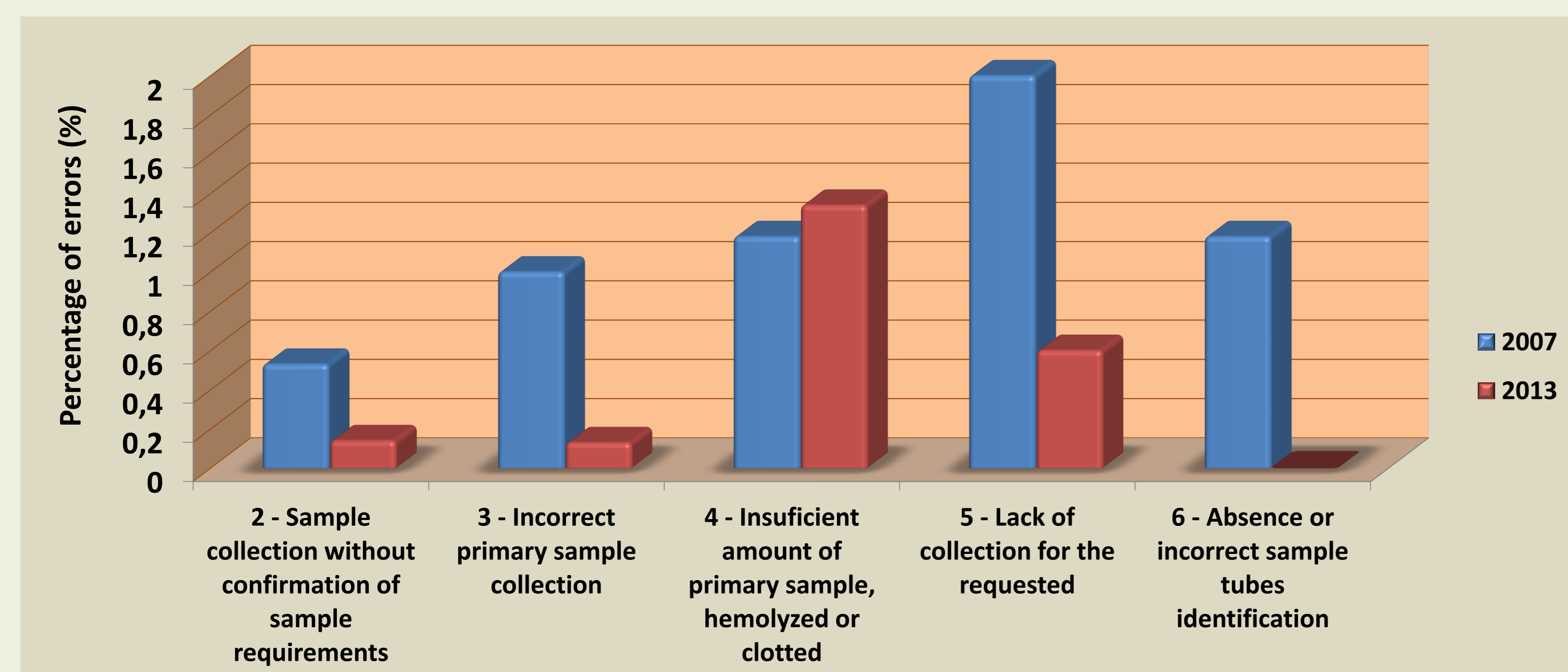
Graphic 1 – The five more representative indicators in 2007 and 2013 surveys regarding sample collection.

It was compared the results of error monitoring on the surveys performed in 2007 and 2013 (with a participation of 27% to 53%, respectively) and the percentage of reported errors is consistent with those described in international literature. The five more representative indicators in the 2 surveys concerned to sample collection are illustrated in the graphic 1. The graphic 2 shows the two indicators evaluated in the both surveys concerned to administrative process.