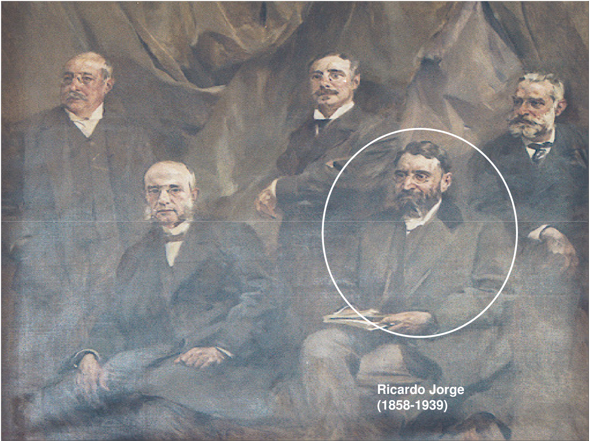
Ricardo Jorge (1858-1939)