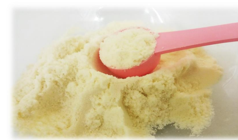
6 scoops of an infant formula powder

Two of the acquired samples were already ready-to-use, while the remaining samples were prepared according to manufacturer's instructions.