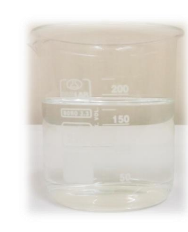
180 mL of boiled water