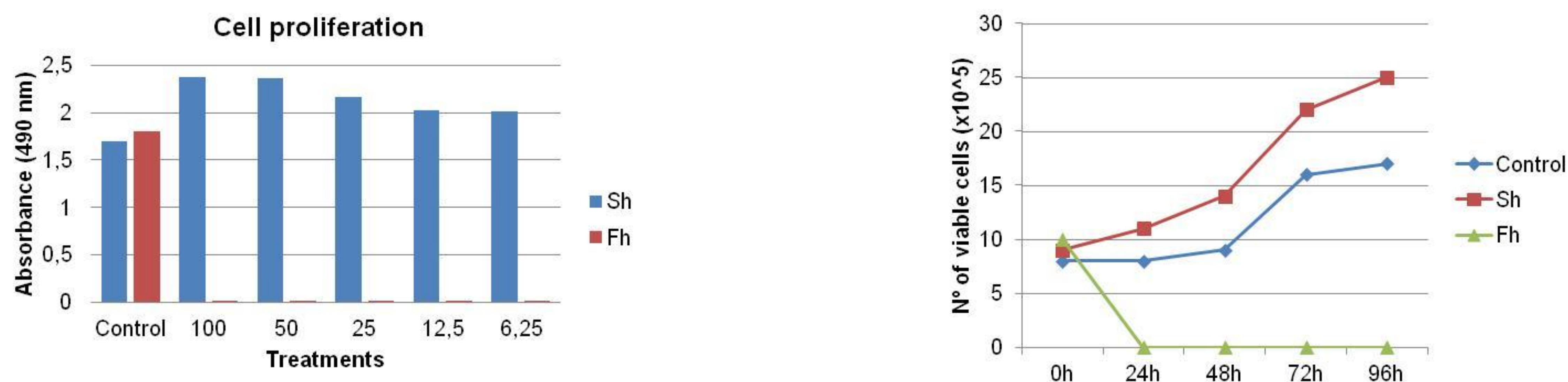
Fig. 2: Cell proliferation assay of Fasciola hepatica and Schistosoma haematobium extracts-treated cells. The growth curve shows that treated cells with F. hepatica showed no growth while cells treated with S. haematobium proliferated significantly faster and more than control cells (Left panel). Trypan exclusion assay of control and F. hepatica and S. haematobium -treated cells. We confirmed the induced necrosis of CHO cells when treated with F. hepatica extracts and increase in cell viability when treated with S. haematobium extracts by trypan exclusion assay. (Right panel).

Surprisingly we observed unexpected death of CHO cells when treated with F. hepatica extracts.